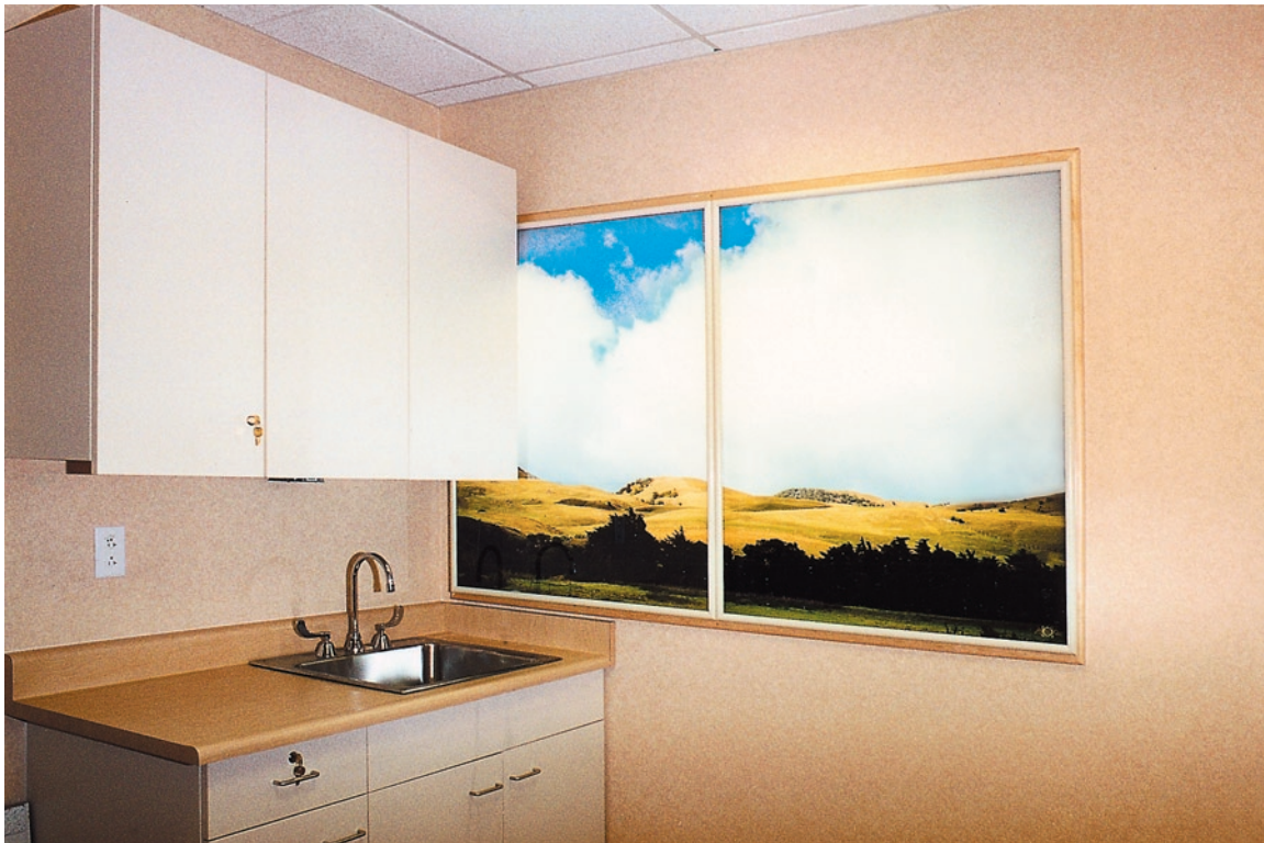
North Hawaii Community Hospital - Mammography Rooms Transparencies in painted aluminum frames placed over existing windows.

Visit our online gallery: www.kastnerdesign.com